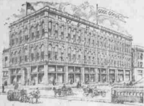
Salem's Department Store