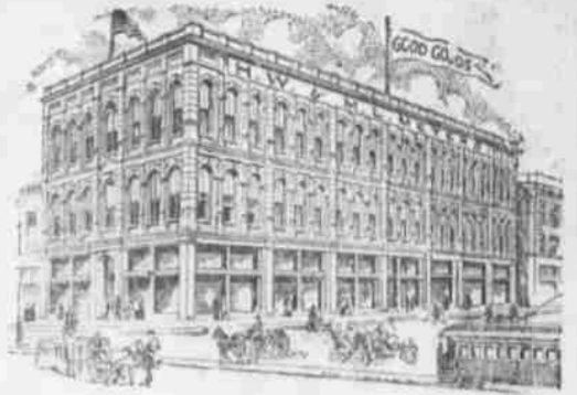
Salem's Department Store

Meyers' Annual White Sale opens with a vast array of attractive bargains. For years we have made a practice of having a Great White Goods Sale after the New Year. Salem women who know the value and qualities and wonderful prices we offer at this time eagerly look forward to the event