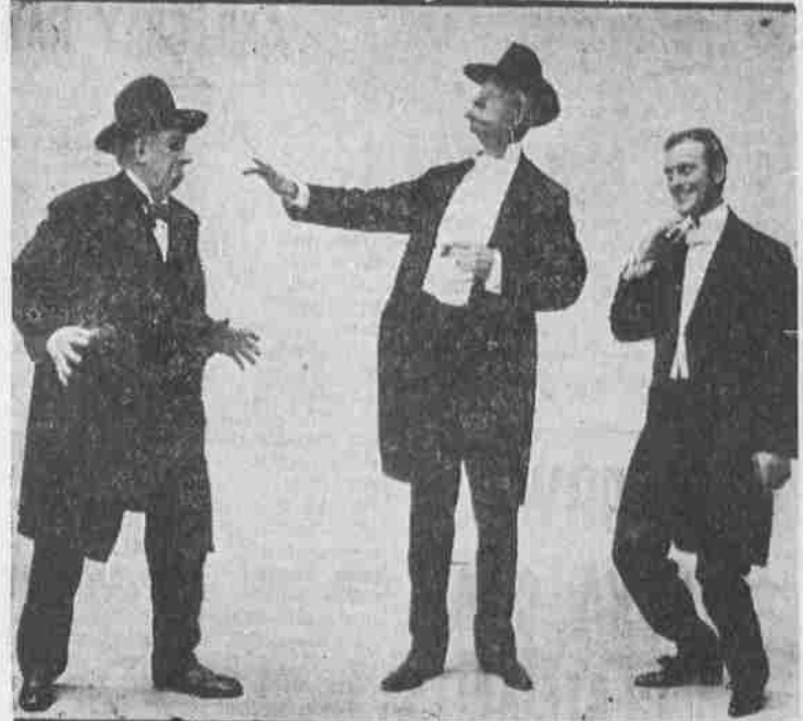
A scene from "Checkers" at The Grand, December 4.

It takes a sweet tempered woman to cheerfully give her new cake recipe to all her friends.