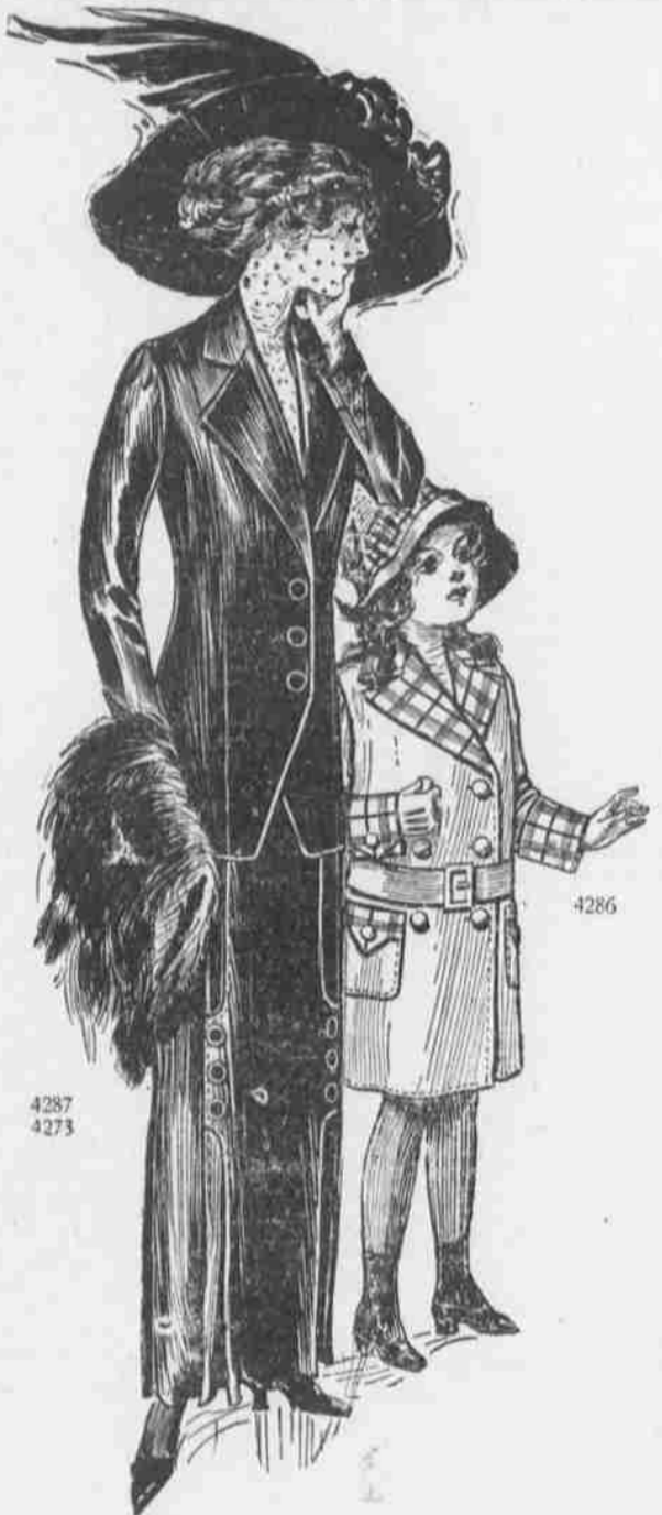
The above designs are by The McCall Company, New York, Designers and Makers of McCall Patterns.

this type of chapeau, in fact, many of them are worn quite plain with excellent effect.