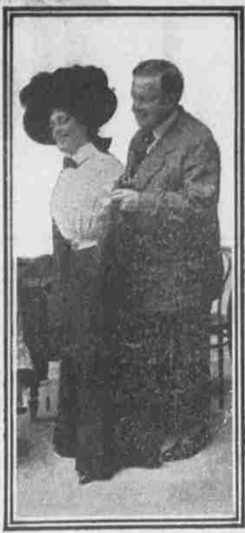
Scene from the "Traveling Salesman"

VICK BROS., Proprietors. Full line of Automobile Supplies, Oils and Gasolene. Autos for hire, storage and repairing. All work guaranteed. Agents for LOCOMOBILE, OHIO, HUDSON, OAKLAND, ELMORE AND FORD AUTOMOBILES AND KELLY TRUCKS. 1912 cars now in. Call and see them. Phone Main 783. 173 South Liberty street.