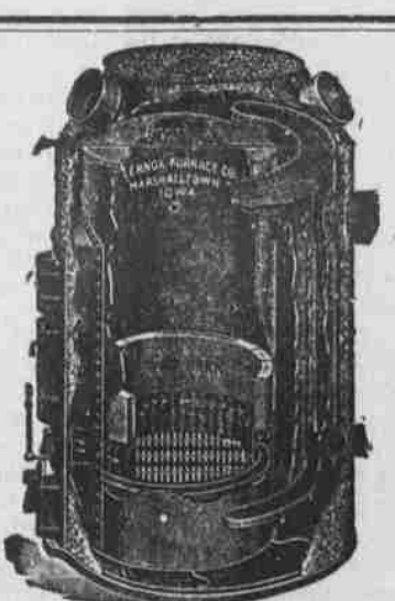
Celebrated Lear Furnace.