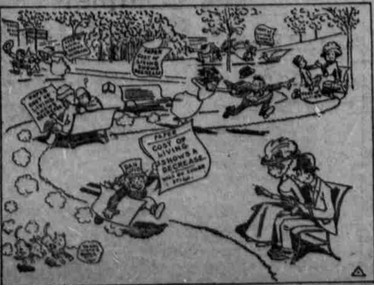
—Fox in Chicago Post.