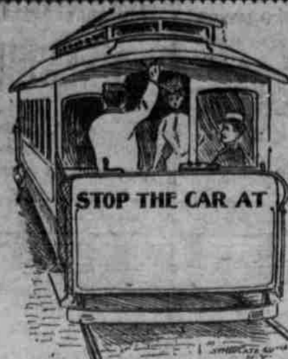
177 LIBERTY STREET

Who put off your Christmas Gift Buying till now! We have many beautiful things that will make elegant presents! Come down and see them!