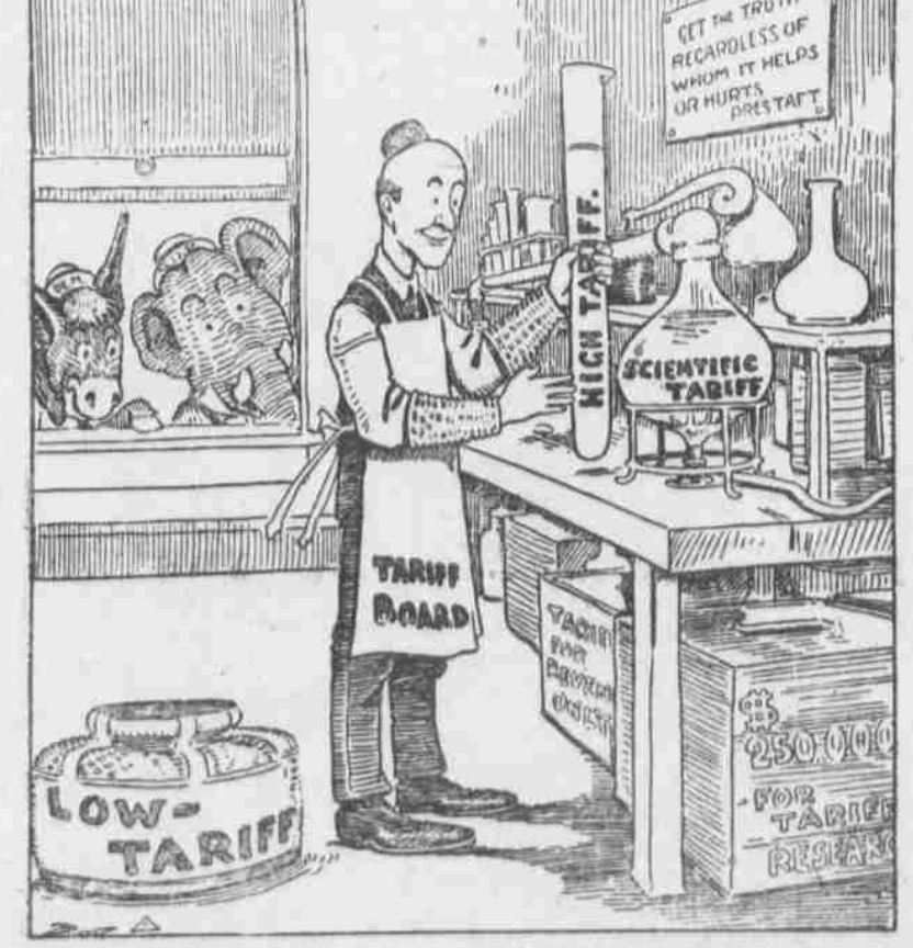
-Minor in St. Louis Post-Dispatch