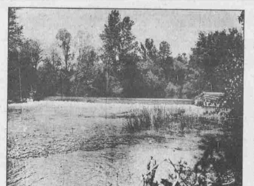
Magnificent Water Power on Thomas Creek, that drives several indus tries at Scio.

a spirit of enterprise and plucky detection of each deal of feed. The output is sold at line spirits up there. They have many towns in the valley and the high standard of citizens landed a county fair, a milk con- flour ranks with the best fancy flour