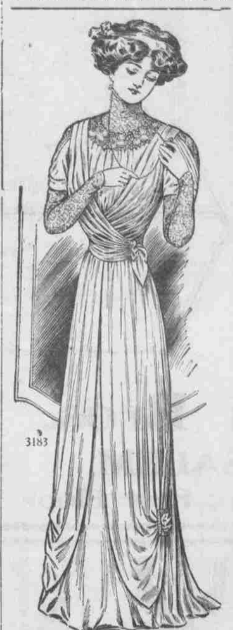
The above design is by The McCall Company, New York, Designers and Makers of McCall Patterns.

Leghorn and Milan braids with horsehair are the material used for the more dressy models and very coarse rough braids are smart for more general wear. Turban shapes of tulle or metal gauze are the pres-