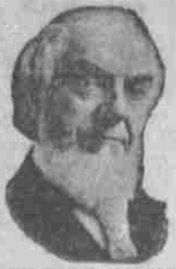
Sermon by CHARLES T. RUSSELL, Pastor Brooklyn Tabernacle.