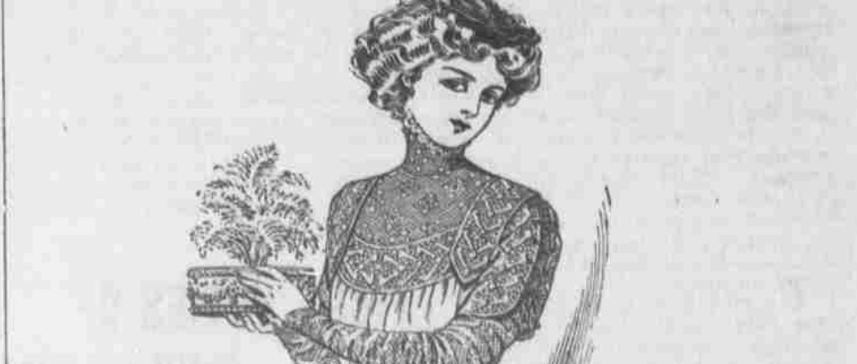
The above designs are by The McCall Company, New York, Designers and Makers of McCall Patterns.

The one piece frock reigns supreme for all elaborate occasions, but with tailor gowns a good many pretty blouses, chiffon cloth, net or flannel are worn.