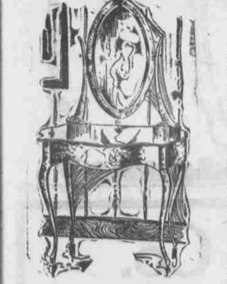
$25 Dressing Table.

The above prizes were purchased from Burfen & Hamilton's big furniture store and will be on display in their show window during this special offer. Call and see them.