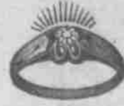
One of the 1100 Diamond Rings, Given one in Each Contest. False Rumor.

cars in use today. This speaks alone for the Ford. How Ballots Are Secured. In all cases where ballots are issued, subscriptions must be paid or prepaid. The full amount of money must be sent direct by mail or brought to the Journal office.