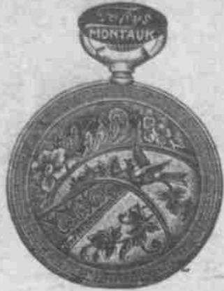
Three of these Beautiful Gold Watch.

one while the opportunity is presented. No contestant is restricted as to the size of her ballot. If she is able to secure ten yearly subscriptions during these twelve days she can do so, and will receive a ballot for 100,000 votes, or in proportion to the number turned in. In no part of this country are the people on the same terms of friendly interest as in this vicinity and for this reason the Capital Journal contest is infinitely more interesting than contests of like character in the east. Here every young woman with public spirit and the sort of energy that counts in the returns, is something of an unconscious politician, or has friends with political genius. Practically all of the Capital Journal contestants have been brought into the contest through enthusiasm of their friends. But the spirit of ambition—a disposition not to be beaten—keeps them going and makes success a matter of personal pride. One given in each district; were bought and are on display at Barr Jewelry Store, Genuine Elgin Works, Hunting Case. The winners of the principal prizes