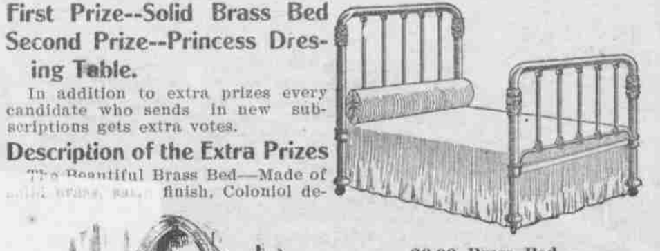
$6.00 Brass Bed.

THIS IS THE CHANCE TO CATH THE LEADERS—BESIDES WIN AN EXTRA PRIZE. Do not hold subscriptions back but send them as you receive them. The contest manager will keep an accurate account of subscriptions from each contestant and will, at the expiration of this offer, mail the Special Offer Ballots to those entitled to same. THIS IS THE GREATEST OFFER OF THE CONTEST. Address CONTEST DEPARTMENT