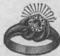
These three fine Rings were purchased of C. H. Hinges and will be on display in the show window. One given in each district.

CONTEST WILL CLOSE DEC. 18, '09 AT 11 P. M.