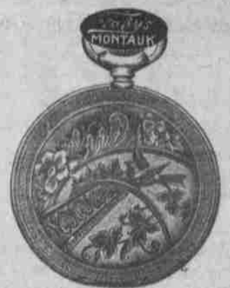
Three of these Beautiful Watches given, one in each district; bought and on display at Barr's Jewelry Store.

CONTEST WILL CLOSE DEC. 18, '09 AT 11 P. M.