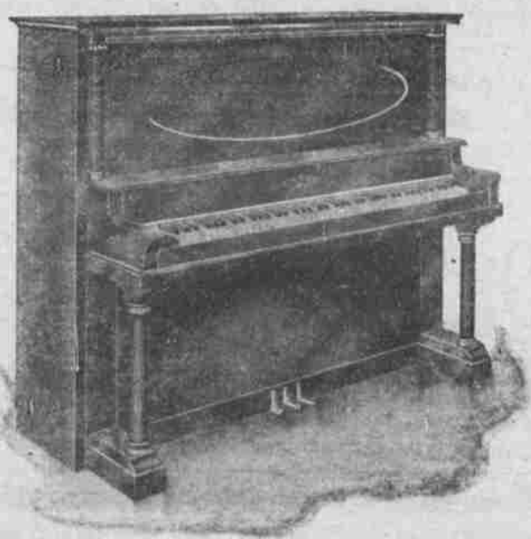
Three $425 Eller Pianos, bought of this well known piano house in Portland. One given in each of three districts.