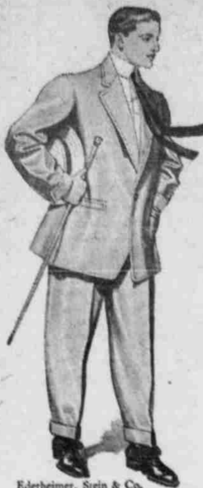
Eiderheimer, Stein & Co. MAKERS