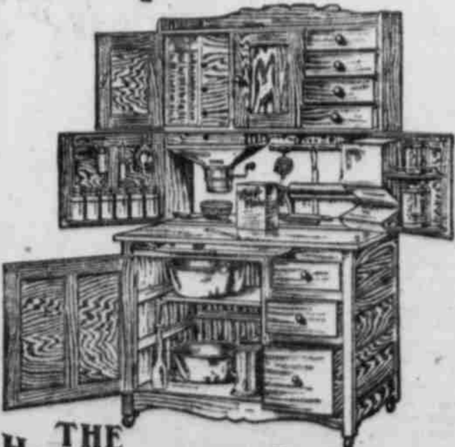
THE HOOSIER KITCHEN CABINET

There isn't any let-up to kitchen work. Three meals a day must be prepared every day in the year. You cannot get out of that, but you can make it easier and do it in half the usual time.