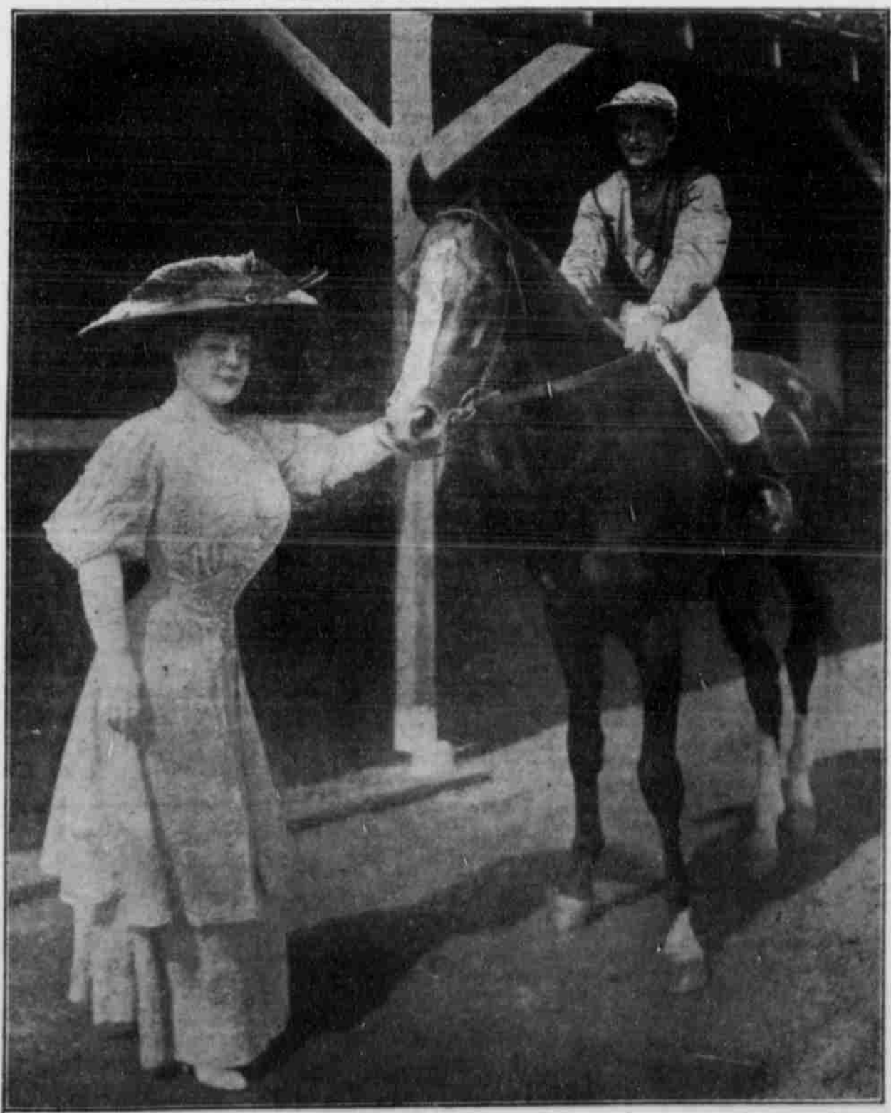
Lillian Russell in "Wildfire."

Name... Address... Mail this Coupon to THE REMEDY ASSOCIATION, 62 East 121st St., New York, N. Y.