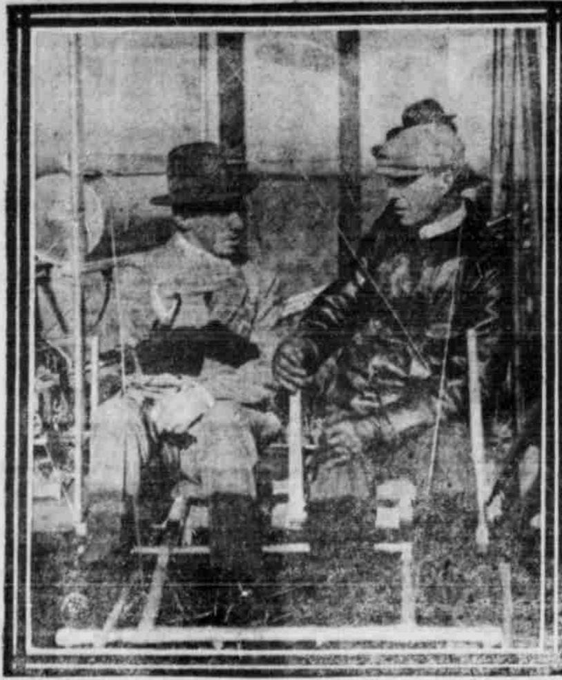
THE KING OF SPAIN IN THE WRIGHT FLYING MACHINE.