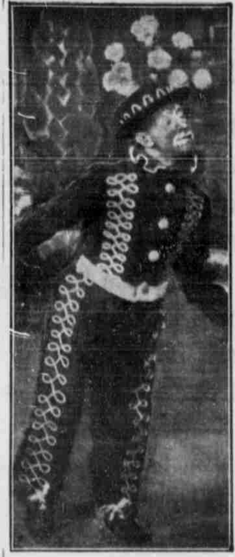
THE GINGERBREAD MAN.

Everyone is looking forward to the coming of the Gingerbread Man,