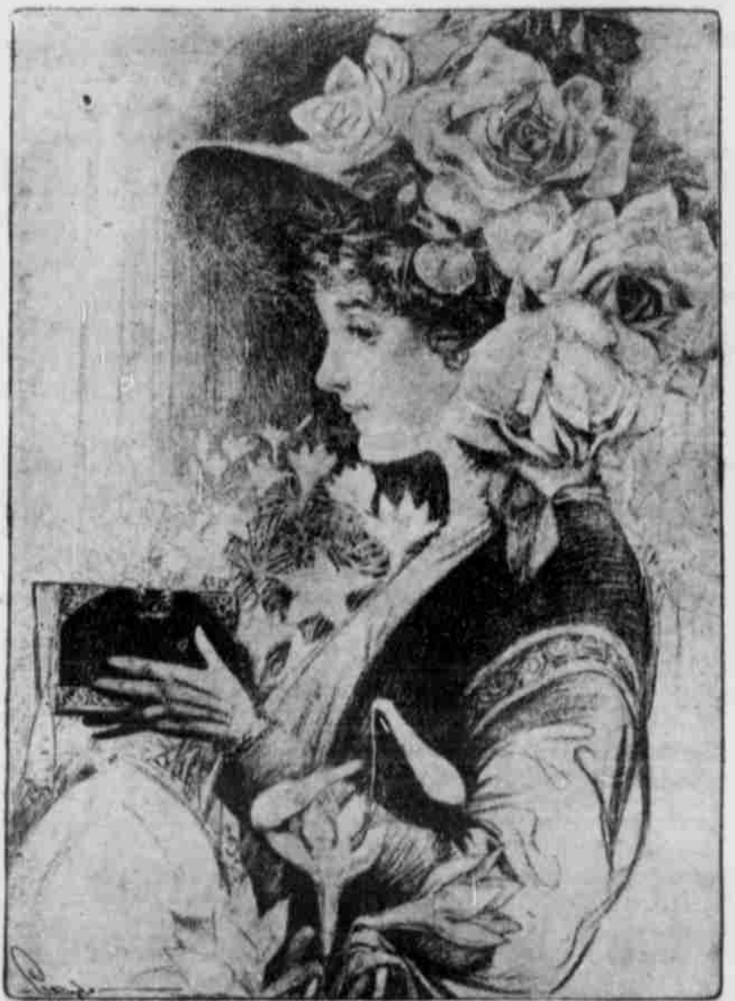
THE EASTER GIRL. The Easter girl is spring's delight. The fairest flower among its blooms, And nature's garden growth brings When she her leadership assumes. Spring's balmy airs wake her to life While fragrant zephyrs round her curl, And lovers gird them for the strife To win the blithe some Easter girl.