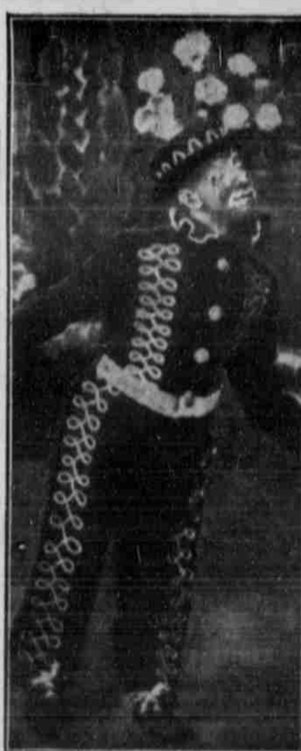
THE GINGERBREAD MAN.

(United Press Leased Wire.) Paris, April 5.—The expected arrival of a child and heir to Anna Gould the Princess De Sagan, according to general opinion expressed here today, has shattered permanently the hope of Count Boni de Castellane of a prospective personal interest in the Gould millions.