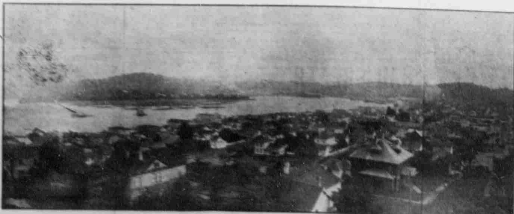
VIEW OF MARSHFIELD, THE METROPOLIS OF COOS BAY