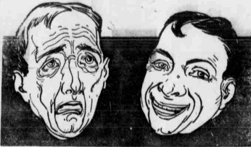
The above illustration plainly shows what a few days use of Gauss Catarrh Remedy will do for any sufferer

Bad Breath, K' Hawking and Spitting Quickly Cured--Fill Out Coupon, Below for Large Trial Package Mailed Free.