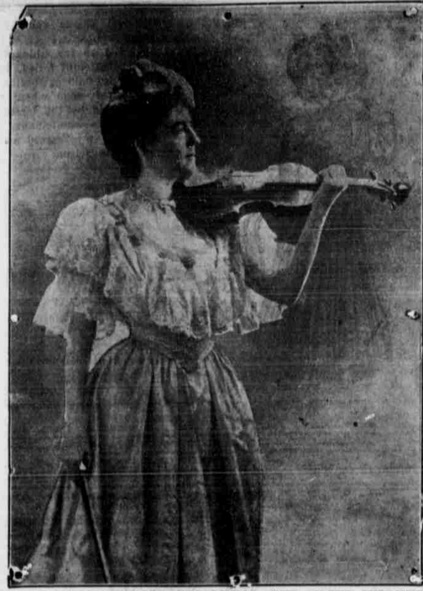
ANOTHER PICTURE OF MAUD POWELL, THE NOTED VIOLINIST.