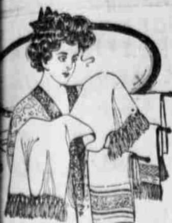
Table Linens of all kinds, yard—25c, 35c, 49c and up.

Napkins of all kinds—5c, 8 1-3c, 10c, 12 1-2c and up.