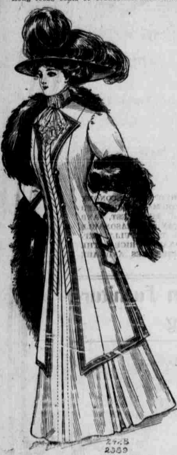
The above designs are by The McCall Company. Patterns may be obtained at any McCall

Long loose coats of broadcloth with flowing sleeves are worn a great including cases, extra, 55c; firsts.