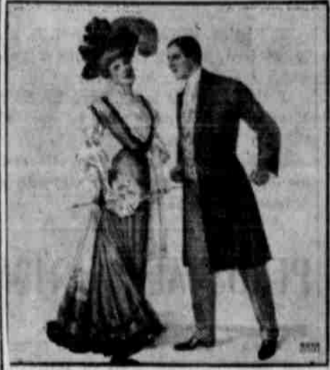
James P. Corbett in "Facing the Music."

Mr. James J. Corbett, whose earnest efforts in recent years as a player of parts, and whose success has been quite sufficient to entitle him to consideration as an actor rather than as a pugilistic champion, will come to the Grand opera house Monday night at the head of his own company in