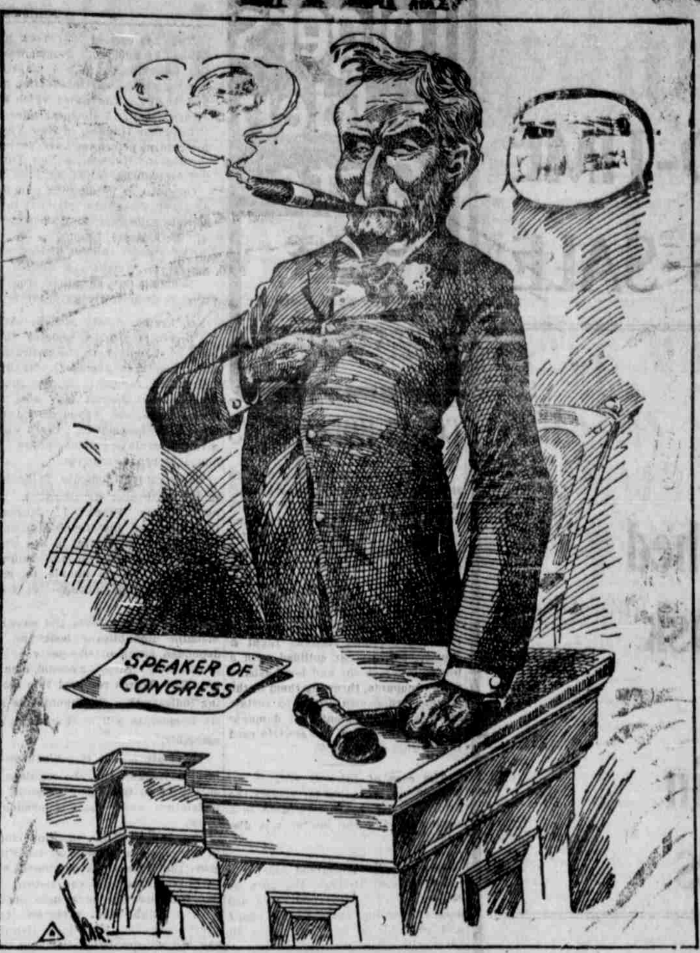
A LITTLE GROGGY AND DISFIGURED BUT STILL IN THE RING