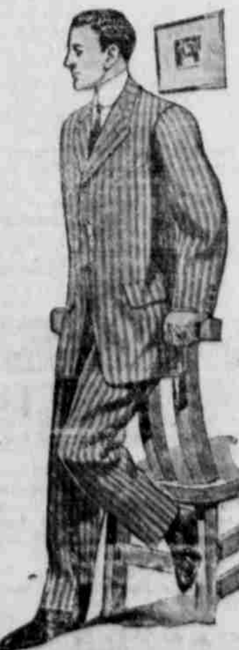
COPYRIGHT 1900 BY THE MAKERS OF MICHAELS-STERN FINE CLOTHING MICHAELS, STERN & CO. ROCHESTER, N. Y.