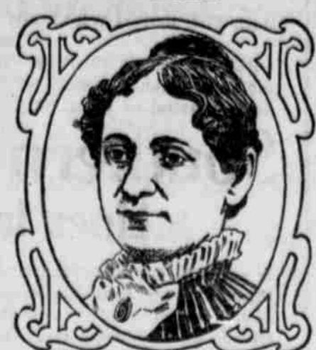
LYDIA E. PINKHAM

No other medicine has been so successful in relieving the suffering of women or received so many genuine testimonials as has Lydia E. Pinkham's Vegetable Compound.