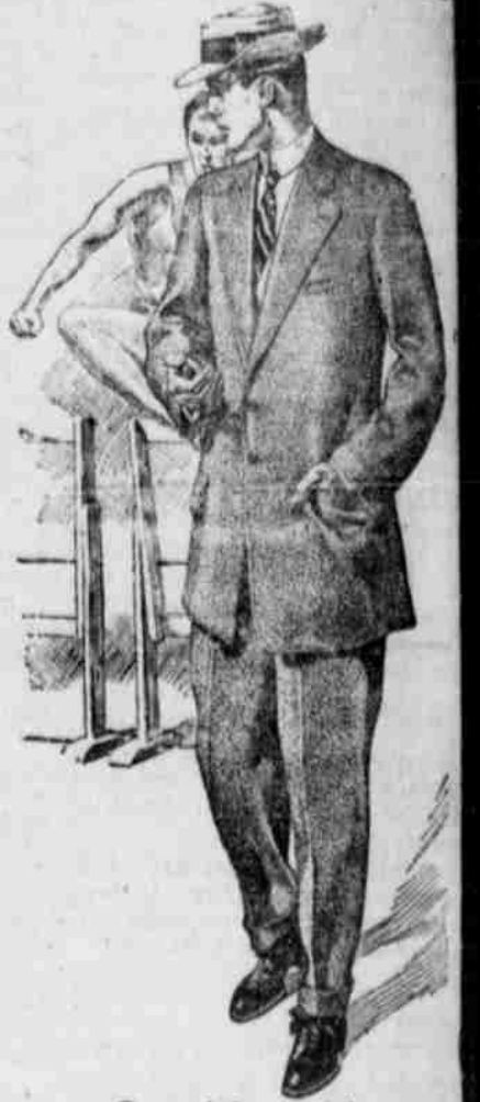
Copyright 1908 by Hart Schaffner & Marx

clothes; that means all wool, perfect tailoring and correct style to be-