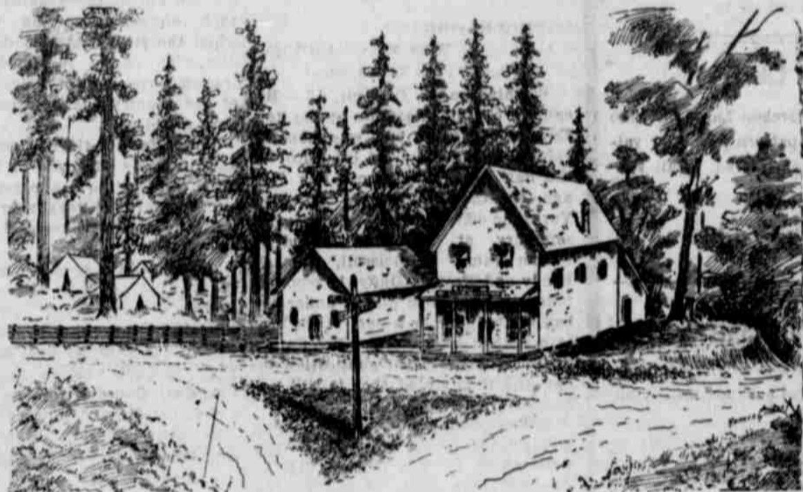
LONDON SPRINGS STORE AND BUTCHER SHOP.

That the Springs as a summer resort are rapidly growing in popular