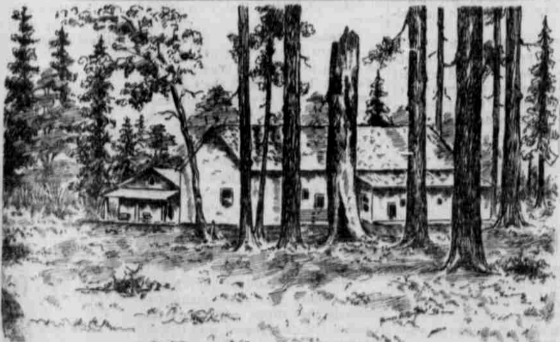
THE BOTTLING WORKS.

favor is shown by the fact that the number of hotel guests and campers this season greatly exceeded the number of any previous year, and the