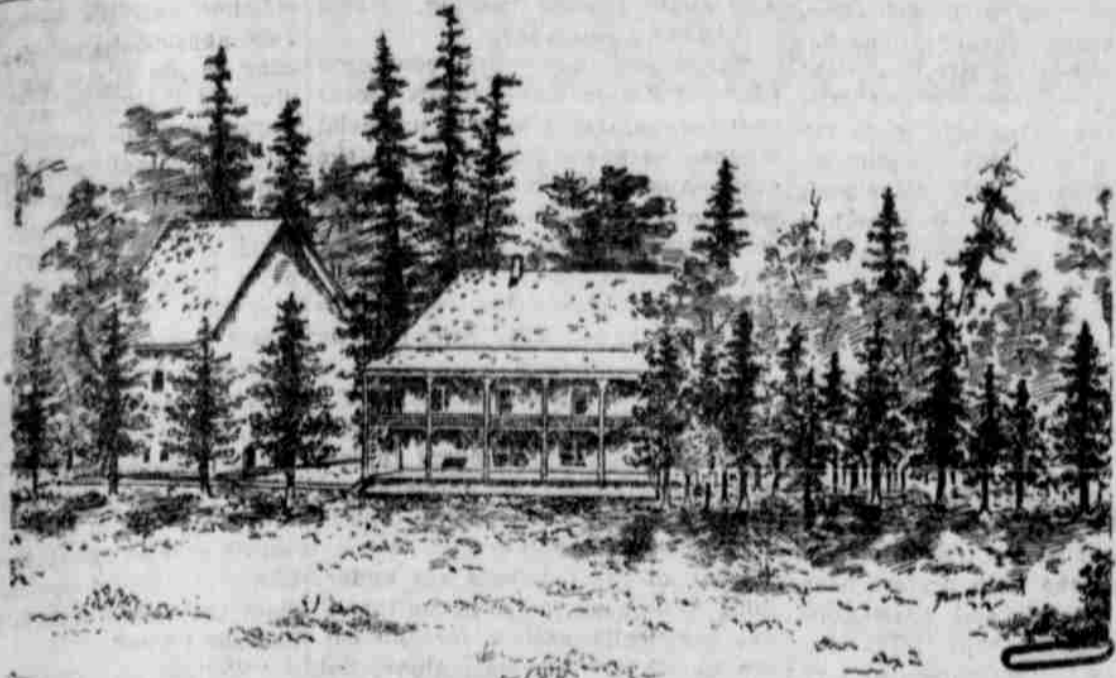
HOTEL AND BATH HOUSE.

duct. The water is unexcelled as a pleasant, refreshing drink, and as a remedy for chronic ailments it has no superior. In fact, many have found it a remedy for strong drink. It is a favorite as a bar water, excellent as a mixer and is sold everywhere. It is guaranteed to be an absolutely pure and natural mineral