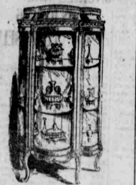
This is an extra good value in China Closets, selected quarter sawed oak with bent ends finished Golden or Weathered. Regular $26, special... $19