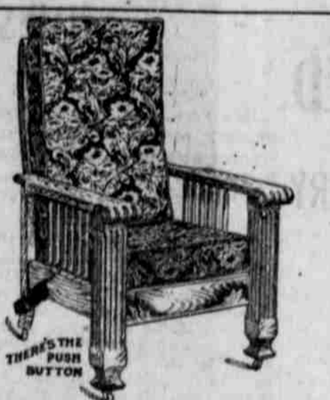
For Solid Comfort and Little Money this Royal Push Button Morris Chair is what you want. Has rich green or red velvet cushions on substantial oak frame. Regular $18.00, special... $13.90

The wind up of a most successful sale is near. Only a few days more and then this great underprice clean up Removal Sale will end. The public has learned from years of buying that when we advertise a sale it means something—it means that every item represents exactly the value we regularly charge and also that the advertised reductions represent just the amount off we promise to give. At the prices now prevailing its hard to understand how anyone in need of housefurnishings can resist the tempting values this Great Removal Sale offers. Keep these facts burning in your mind and secure your needs before we commence to move into our new building on Court street.