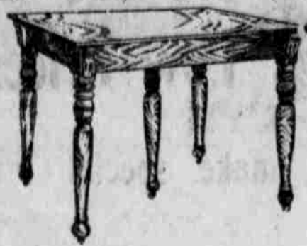
Six-foot Extension Table; regular $6.50, sale price.....$4.50

THE PEOPLE OF SALEM AND VICINITY ARE TAKING ADVANTAGE OF OUR GREAT CLEAN UP SALE. NOW IS THE TIME TO GET IN LINE WHILE YOU GET OUR PROFITS. REMEMBER THIS SALE LASTS ONLY TILL JULY 4TH. WE HAVE LOTS OF GOOD BARGAINS FOR YOU TO REAP THE BENEFIT OF.