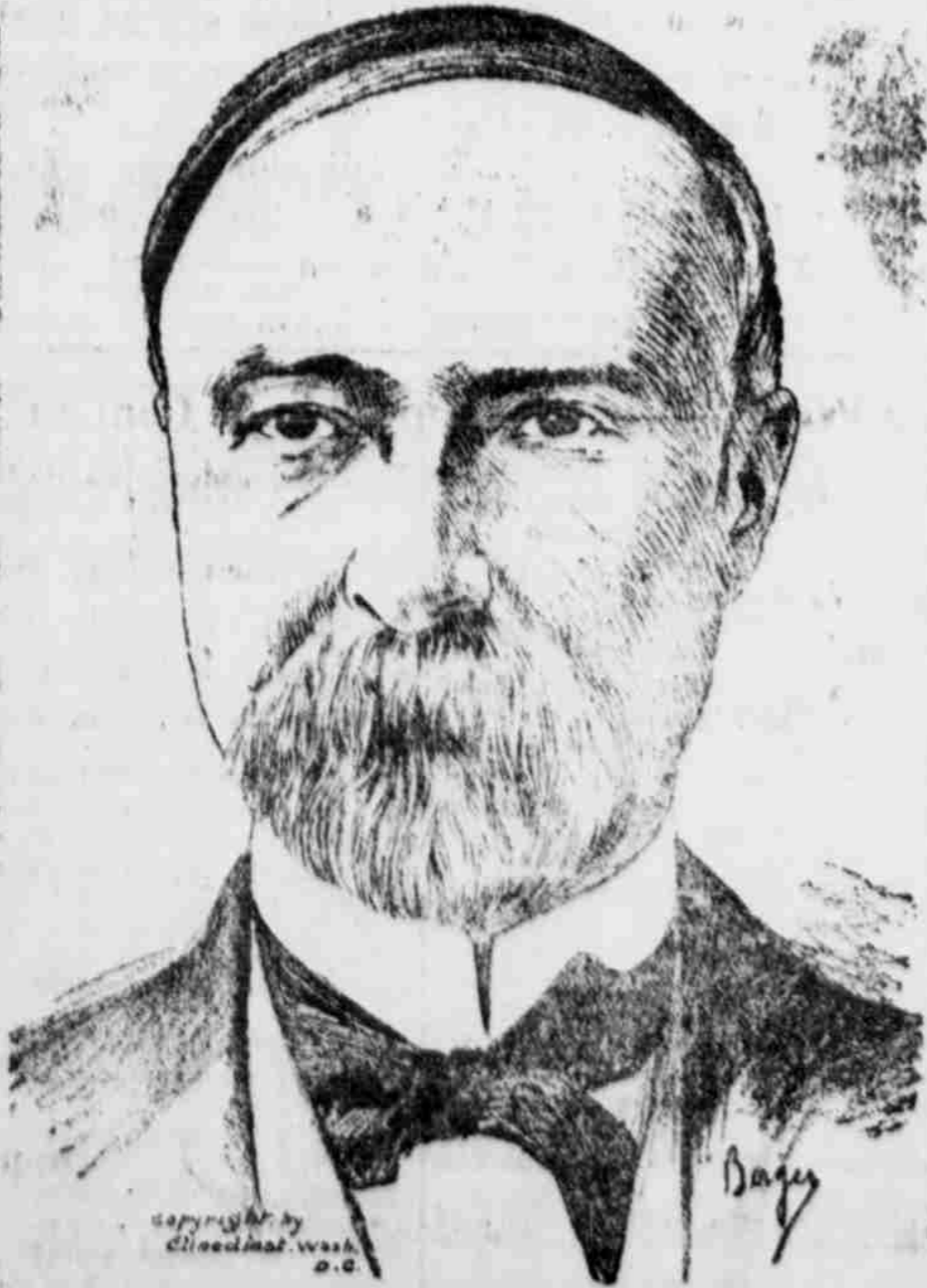
CHARLES W. FAIRBANKS OF INDIANA. REPUBLICAN PRESIDENTIAL POSSIBILITY