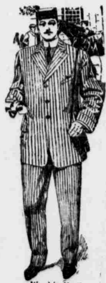
Washington Fashioned Apparel THE WASHINGTON CO. 419 1/2 2ND

You'll come to us for your Spring Clothes if distinctive style and quality are important to you in garments that fit perfectly.