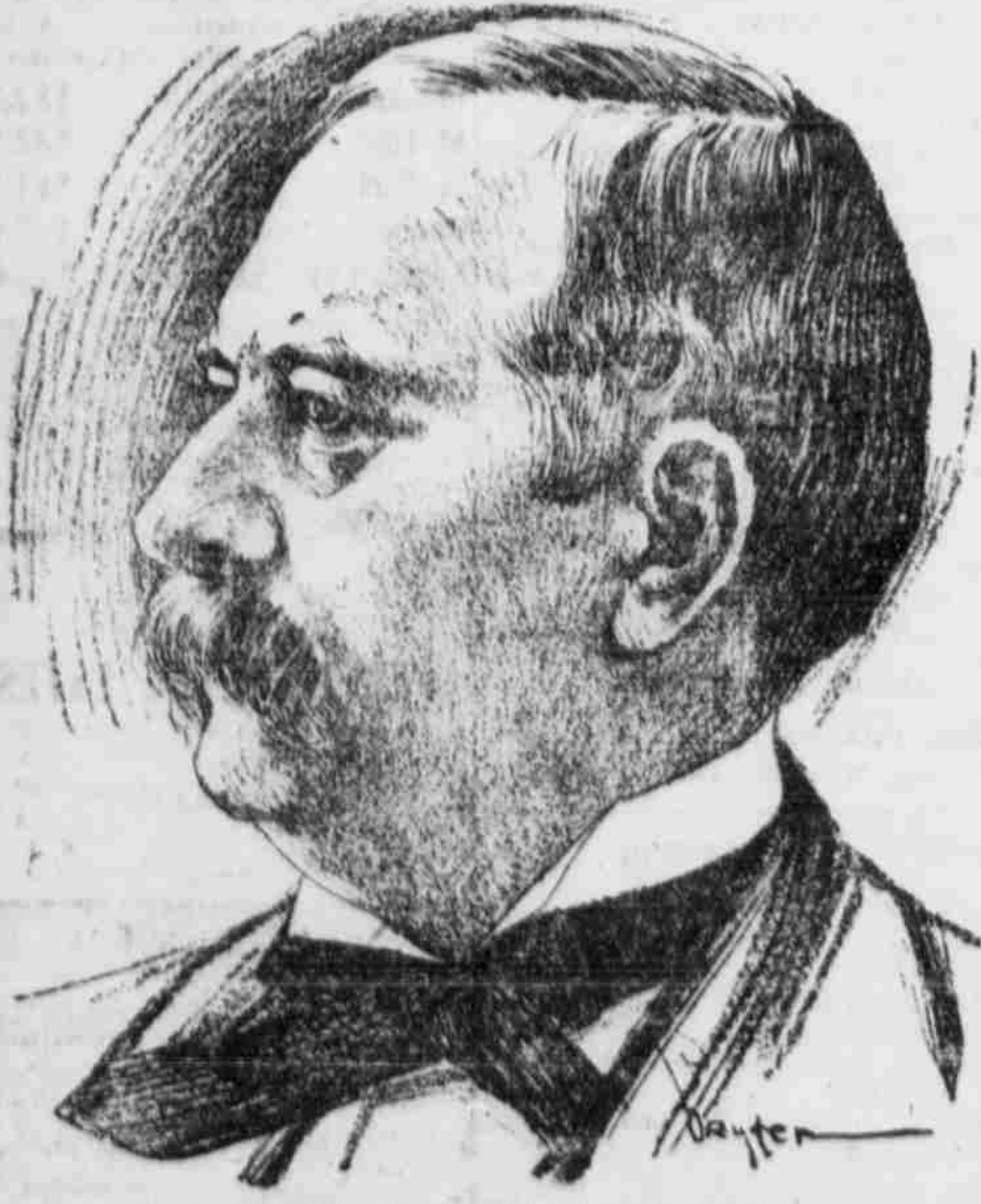
JOSEPH B. FORAKER OF OHIO.

Peruna Tablets. Some people prefer to take medicine rather than to take medicine in tablet form. Such people can obtain Peruna tablets, which represent the same ingredients of Peruna. Each tablet is equivalent to one average dose of Peruna.