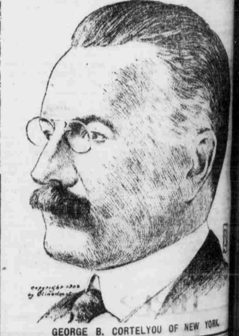
GEORGE B. CORTELYOU OF NEW YORK.

Chicago, April 30.—Snow storms raged today in several central states, even as far south as Kentucky. * In Pittsburg, Pa., snow began falling early, with the temperature two degrees above freezing. It is not thought that any damage to vegetation will be done unless it grows colder. A snow storm prevails practically over the entire state of Ohio. Early this morning it began to fall in Cleveland. Reported from Cincinnati it is falling there, but the weather is not cold enough to do much damage to the crops. A heavy snow storm has raged in Zanesville, Ohio, since midnight. Streetcars were forced to suspend operation on account of falling poles, which were knocked down by the wind. In Lexington and Louisville, Ky., snow also fell today. Two inches fell in both cities. It is prevalent in eastern and central Kentucky. Races were not run in Lexington because of the snow. Reports of a heavy trust are received from Missouri, Iowa, Kansas and Wisconsin. Fruit growers differ as to the amount of damage done.