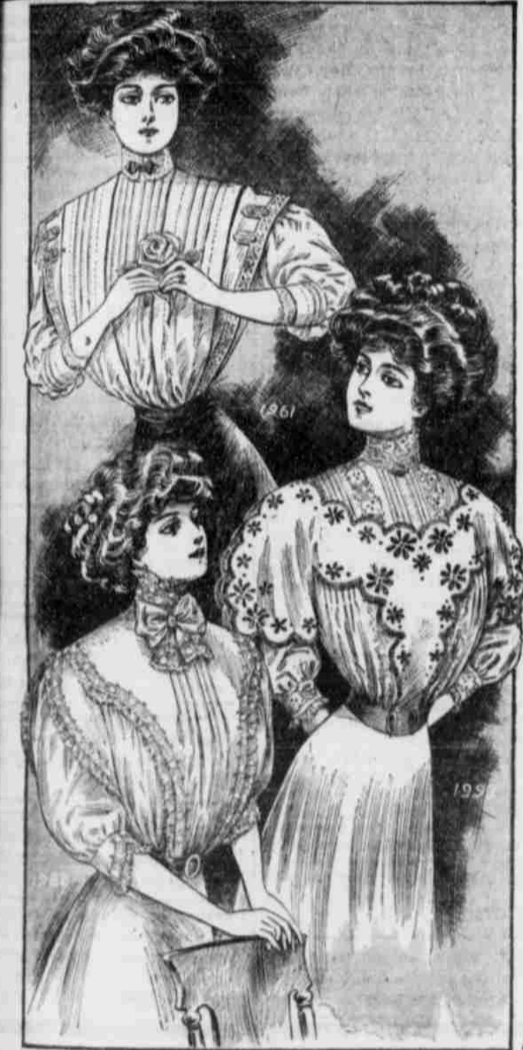
above design is by the McCall Co. of New York, Publishers of Fashion and manufacturers of McCall Patterns.

The Latest Neckwear. High lace collars, fluffy bows, lace or lingers jabots, and the greatest variety of linen collars have been brought out to wear with this season's shirt waists. Then there are very large bows of lace, net, mull or lawn with hem-stitched ends