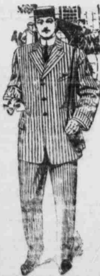
Washington Fashioned Apparel

This week we are making a special showing of $15 suits. It will pay you to see what excellent quality, and fit you can get in the