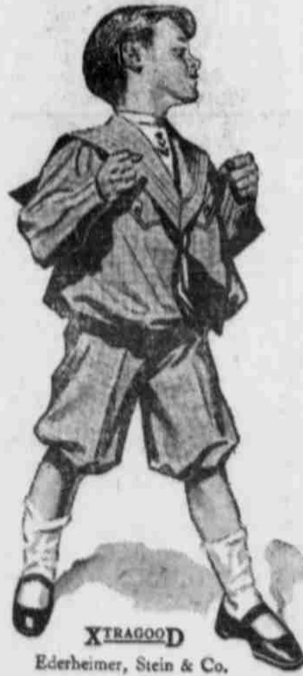
XTRAGOOD Ederheimer, Stein & Co. MAKERS