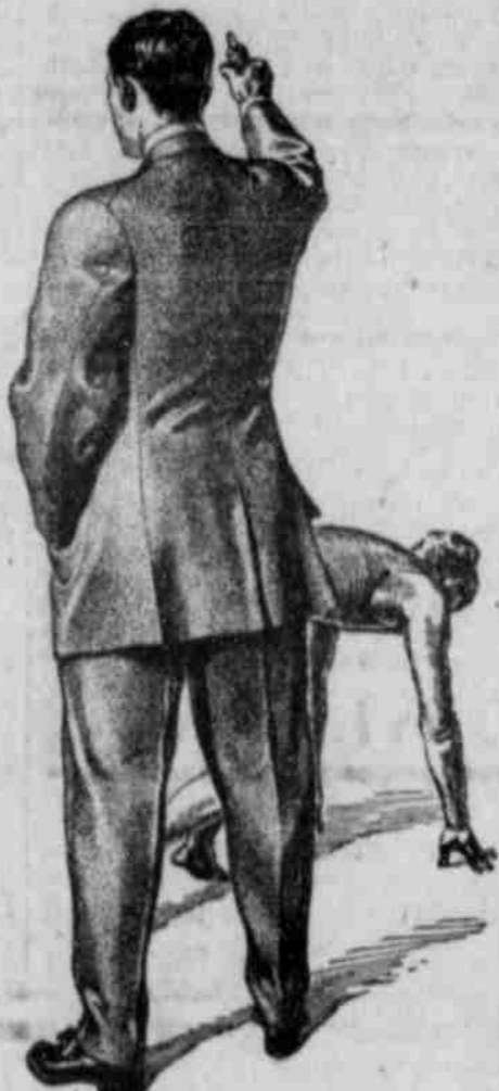
Copyright 1908 by Hart Schaffner & Marx