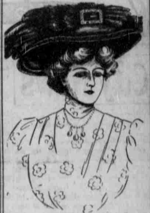
Hundreds of pretty Spring Hats, flowers, wreaths and shapes now on exhibition. Just come and take a look through and see what the CHICAGO STORE is doing.