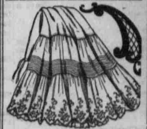
Piles of beautiful Muslin Skirts stacked high up on our sales tables