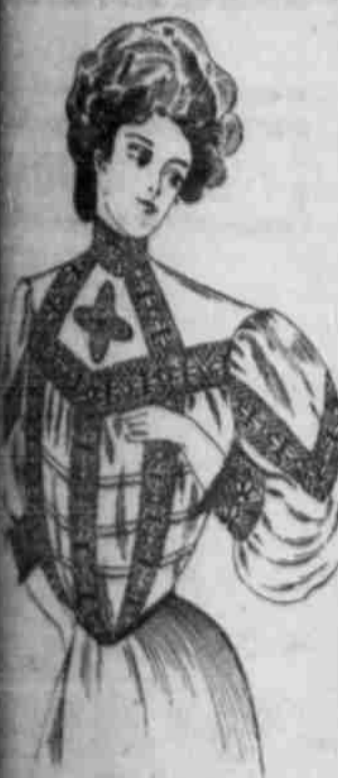
See our fine every class and kind... Silks wool... priced away down... 39c and up.