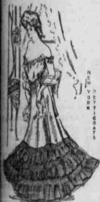
See a grand assortment of... in Silk Heatherbloom and... Prices from 95c and up.

Now opened in the different departments and ready for your inspection. They comprise both Foreign and Domestic Goods, selected carefully and bought at the lowest rock bottom prices. Our customers will receive the benefit of our close buying. Fine Silks, Ladies' Suits, Millinery, Laces, Embroideries, Domestic, Dress Goods, Wash Goods, Fancy Goods and Hosiery.