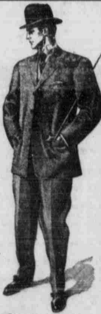
Copyright 1907 by Hart Schaffner & Marx