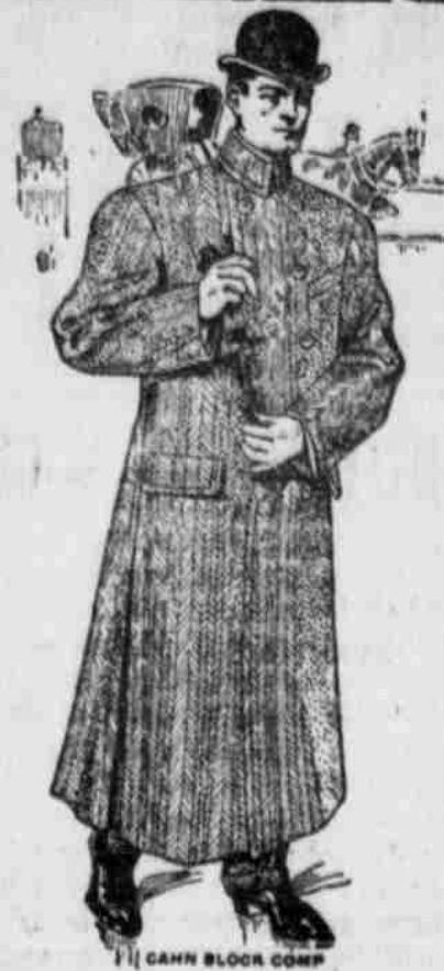
J. CANN BLOOR COPY

New goods are coming in every day and they bespeak the slogan of this store, "We get the best the market affords." There is no exaggeration about our advertisements, every statement is backed up with the goods. If we offer an article at a special sale for one day only we do it in an honest, upright manner and it is invariably a bargain worthy of your investigation.