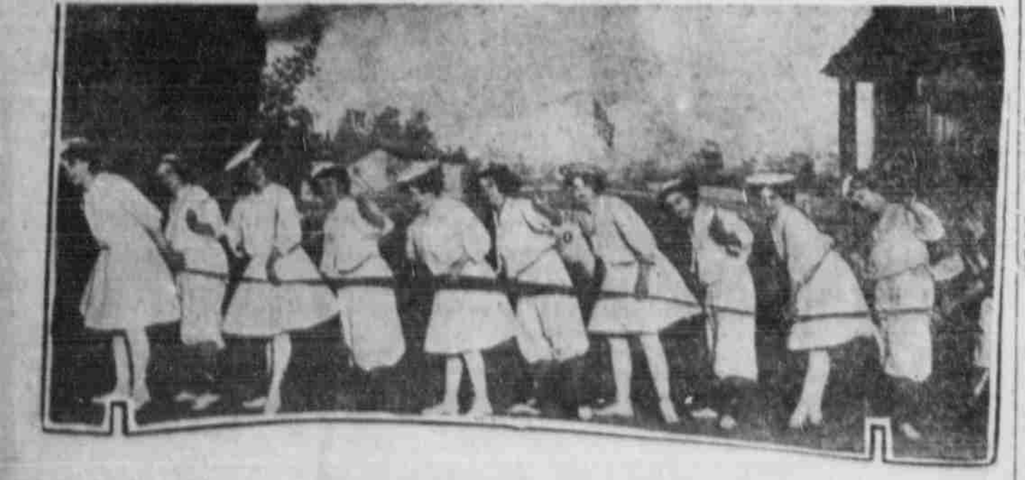
DANCING MAIDS IN $10,000 BEAUTY COMPANY.

MADAME DEAN'S FRENCH FEMALE PILLS. A Pure, Certain Relief for Irregular Menstruation. NEVER KNOW TO FAIL. Only 25c a box.