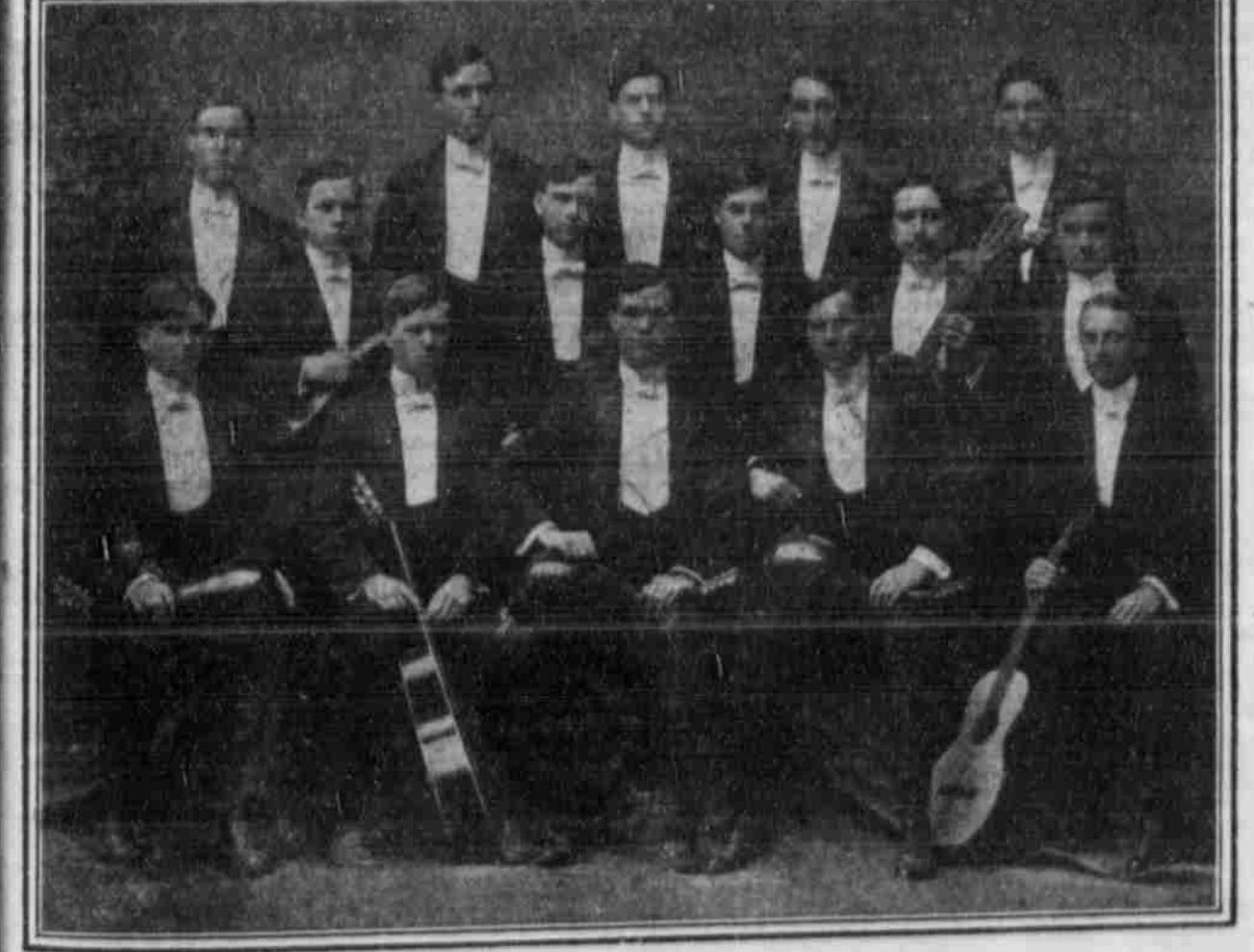
STANFORD MANDOLIN CLUB.