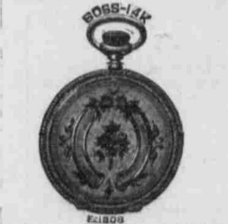
Ladies' watch, Elgin or Waltham, finely jeweled movement, gold-filled case. Warranted for 20 years.