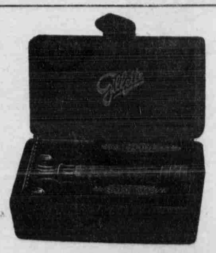
A more acceptable Christmas gift cannot be found than the Gillette. In sets $5.00 and up.

We carry many things that would make suitable Christmas gifts. Call and insped our lines and you will be convinced.