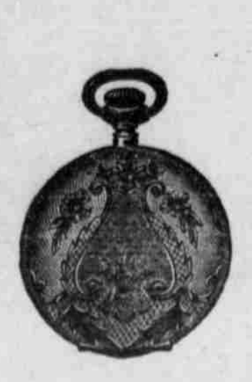
$14.50 Gold Filled Richly Engraved Hunting Case Guaranteed 20 Years Finely Jeweled Elgin or Waltham Movement.