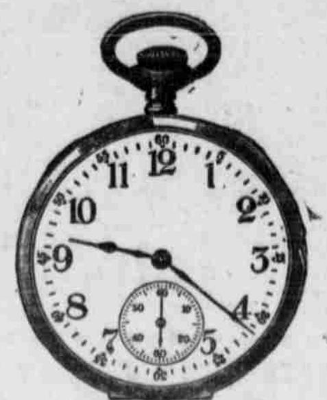
$35,00 14-K Solid Gold Engine Turned or Plain Po!ished Hunting Case, 15 Jeweled. Elgin or Waltham Movement,