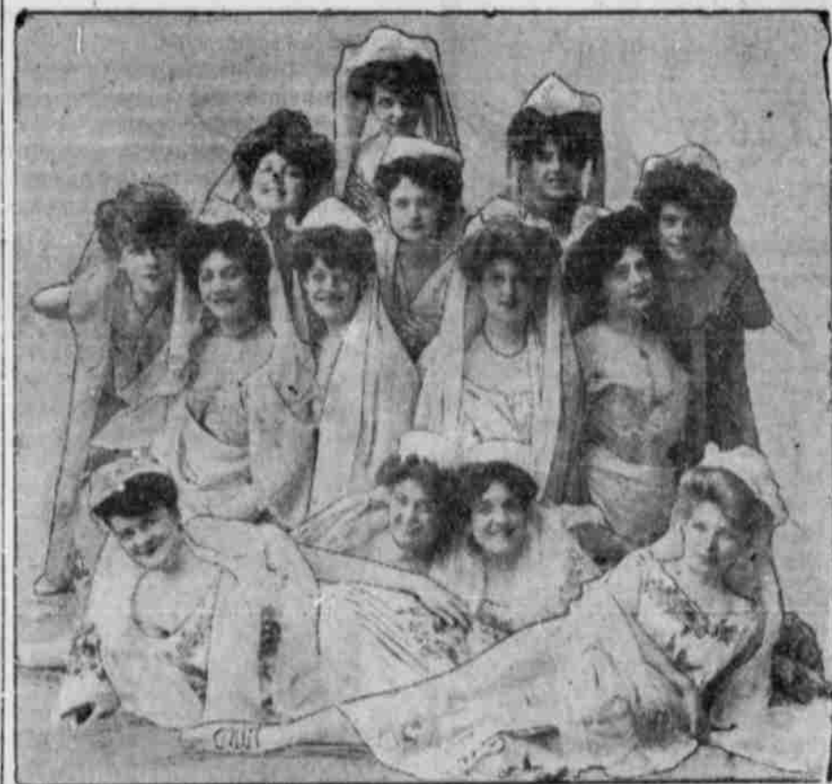
Part of the Beauty Chorus in "The Royal Chef."

Musical Comedy Thursday Night. The newest type of musical production is "The Alaskan," book and