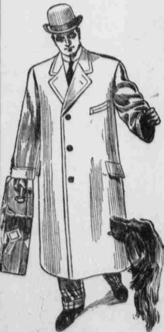
Washington Fashioned Apparel THE WASHINGTON CO. NEW YORK

Sack Suits - $10.00 to $30.00 Overcoats - $10.00 to $27.50